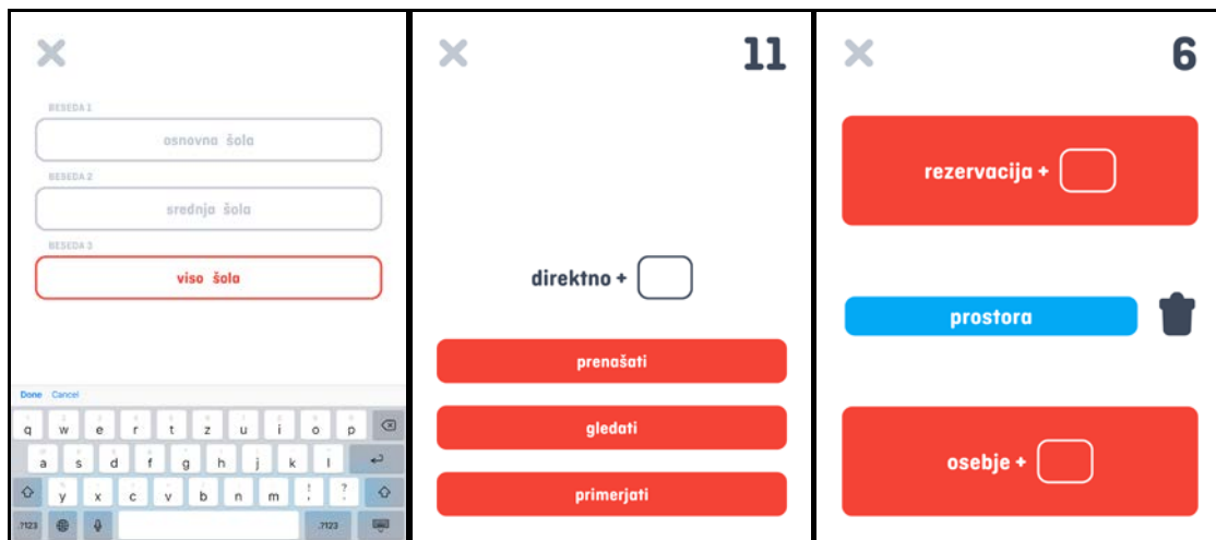
Figure 1: Game modes in the collocation module: Type ; Choose ; and Drag .

All modes are available in the Competitive format, which automatically creates game rooms at regular time intervals. Thus, the players, after picking the mode they want to play, enter the game room running at the time (or wait until the next one starts), play the same words/collocations and compete against each other. The second format used was called Thematic and gave us more control in picking group headwords on a certain common topic (e.g. winter holidays, Christmas, 50-year anniversary of Moon landing). The Thematic format, which was primarily devised to facilitate the promotional activities of the game, was open in a specified time span, each player could play the topic batch only once, and the top players received practical prizes.