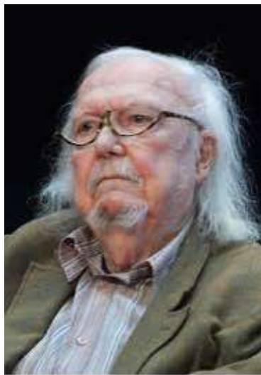
In Memory of Alain Rey (1928-2020)