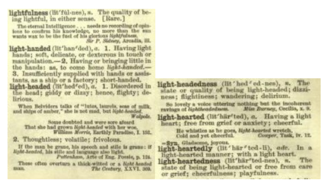
Figure 1: Entries for compounds and derived words from the Century Dictionary, p. 3448.

In essence, Whitney claims that users of the dictionary are familiar enough with meanings of certain derived words and compounds and their formation that these words need not be included in the dictionary. Given the size and scope of Whitney's dictionary, not including many regularly derived words because they are assumed to be "too obvious" in meaning and formation is an odd decision and contrasts with the practice of listing undefined forms as run-on entries that is adopted in Merriam-Webster dictionaries (as will be shown in §3.1.2). At the very least, providing the written form gives the reader notice that the word exists and is in use, and also establishes the spelling and syllabification. In fact, a cursory look at the dictionary indicates that Whitney did not always follow his own guidelines in this respect, as can be seen in Figure 1.