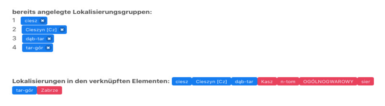
Figure 2: Localisation editor.

Details zu den eingegebenen Lokalisierungen: