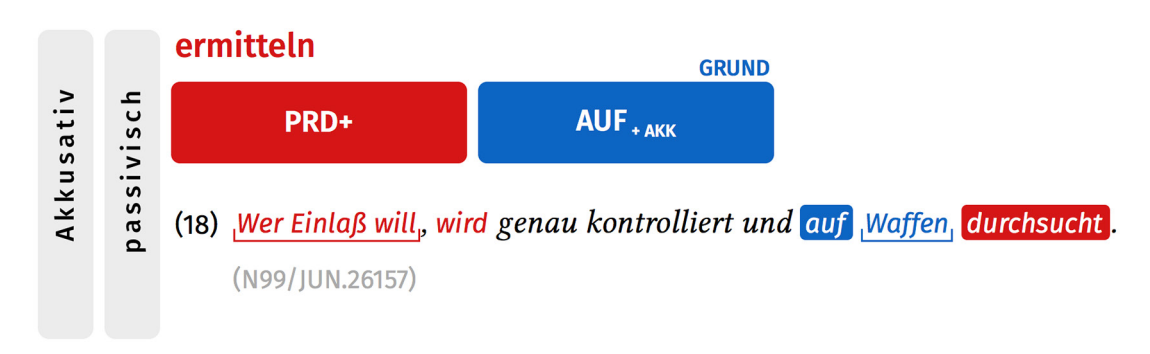
Fig. 3: Sample representation, auf -pattern ERMITTELN, with passive voice and augmented predicate ("PRD+")