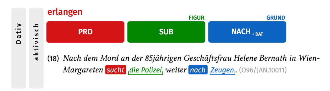
Fig. 1: Sample representation, nach -pattern ERLANGEN, with GROUND in dative case

For means of illustration, figures (1)–(3) show the representation of three semantically similar, but formally distinct realisations of argument structure patterns with the prepositions nach, um and auf: figure 1 shows an active pattern with two arguments, the marker nach and a dative GROUND argument. Figure 2 also shows an active pattern with two arguments, but here with the marker um and an accusative GROUND. Figure 3 shows a passive pattern with an augmented predicate and only one realised pattern argument, the accusative GROUND introduced by auf: