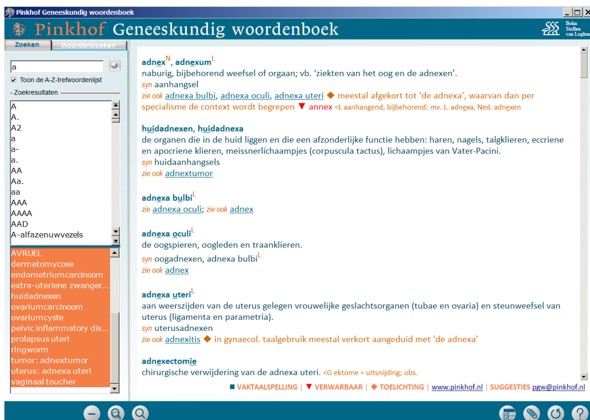
Figure 5. The Pinkhof PC edition showing the adnex entry.