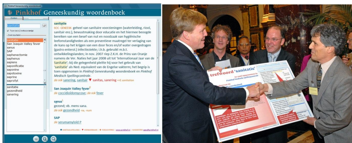
Figure 7. Introducing in 2008 my medical spellchecker to the Dutch crown prince, HRH Willem-Alexander van Oranje.

In 2008 the Dutch crown prince suggested including sanitatie in spellcheckers; his wish was my demand.