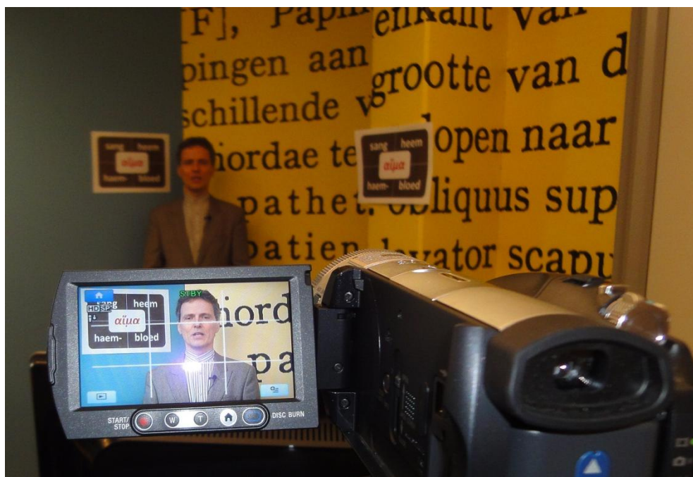
Figure 8. The author whilst video-hosting a medical dictate, notably in front of office wallpaper with enlarged text taken from the Pinkhof medical dictionary.

From 2012 onward, I will be writing and hosting a quiz on medical language for students from all Dutch medical universities participating in the annual Rosalind Franklin Contest. My multiple-choice questions will confront both candidates and the participating audience alike with orthographic and semantic pitfalls in medicine.