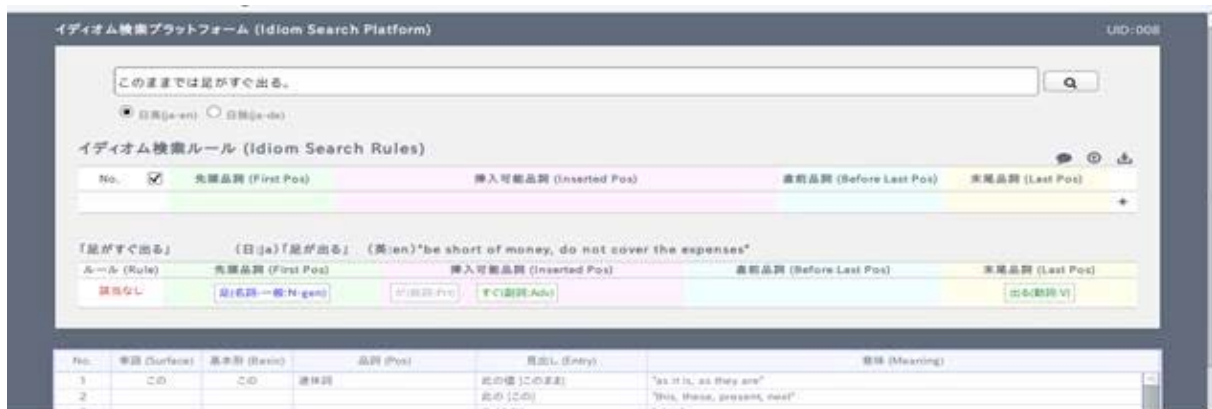
Figure 1: Initial system output for “このままでは足がすぐ出る”.

The initial screen consists of a search box into which text (a sentence) that contains an idiom can be input. Figure 1 shows the system output when a user inputs the sentence “このままでは足がすぐ出る。” (kono mama deha ashi ga sugu deru = we will run short of money soon). The system outputs an idiom entry matched to this input, together with word-level matching information. Note that the idiom entry “足が出る” is retrieved through gapped matching.