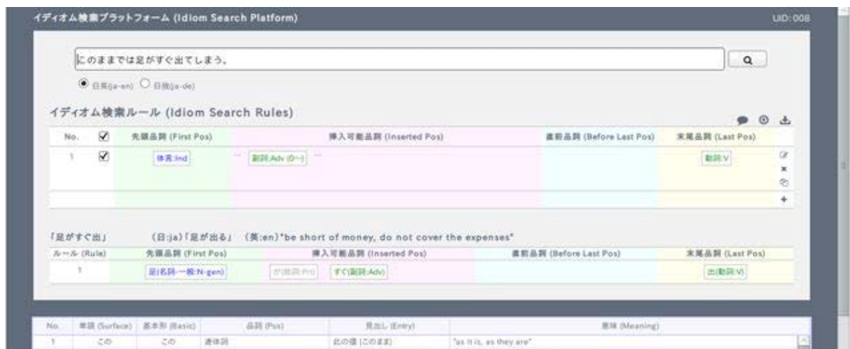
Figure 3: Validating the rule.

This example shows that an adverb can be inserted between “足が” (ashi ga) and “出る” (deru), which enables us to define a rule allowing for the insertion of (an) adverb(s) in this position. The definition of a rule can be done by choosing POS patterns from the pull-down menu for the two constituent elements of the idioms and possible POSes which can be inserted in between (Figure 2). Once the rule is registered, the matching is carried out by applying the rule, which is shown by the rule number given in the result in Figure 3. Rules are defined as POS-based filtering patterns, so rules can be applied to other idioms which were not used for defining the pattern. The rule set can be downloaded as a text file.