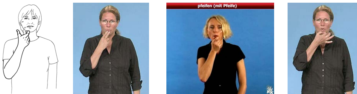
Figure 1: DGS signs PIPE, WHISTLE1 (Source: [5e]), WHISTLE2 (Source: [6]), AND WHISTLE3 (Source: [5e]).

WHISTLE1 and WHISTLE2 can also mean “producing a whistling sound, whistling”. Another DGS sign listed for this meaning is WHISTLE3 (see figure1). On the iconic level the three signs for whistling are specific as to how the whistling sound is produced: WHISTLE3 shows how thumb and index finger are rounded to an O and put to the mouth producing the sound without the help of a whistle, while for WHISTLE1 and WHISTLE2 a whistle is involved. The question arises whether these iconic differences are reflected in sign usage or not. In a specific context the sign used will usually be the one that iconically best matches the named or described incident. 14 Thus the “whistling” sense of the signs could be further specified as “producing a whistling sound by blowing into a whistle” for WHISTLE1 and WHISTLE2 and “producing a whistling sound by using your fingers in the indicated way” for WHISTLE3. Sign language users may find this trivial or logical or even unnecessary information since the form of the sign shows these aspects of meaning, but this only proves the point that iconicity plays a role in sign language use. Whenever the selection and use of a particular iconic sign takes its underlying image into account this kind of information should be made explicit in a dictionary and thus be accessible to the language learner. This can be done by listing the specific meaning as determined by the iconic value of the sign as one of the sign’s senses.