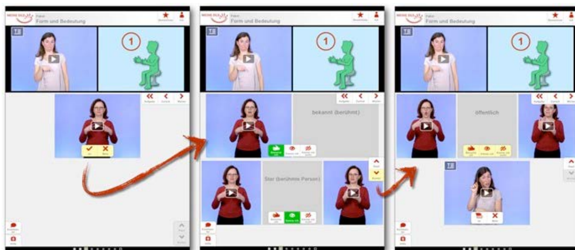
Figure 6: Example page of a work package “Form and Meaning” 20 .

Work packages are organised in pages and rows. Task explanations and questions are all presented in DGS and written German (a button allows to switch between both languages), other content is provided as film, text or pictures depending on the purpose.