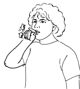
Figure 5: BEAK.