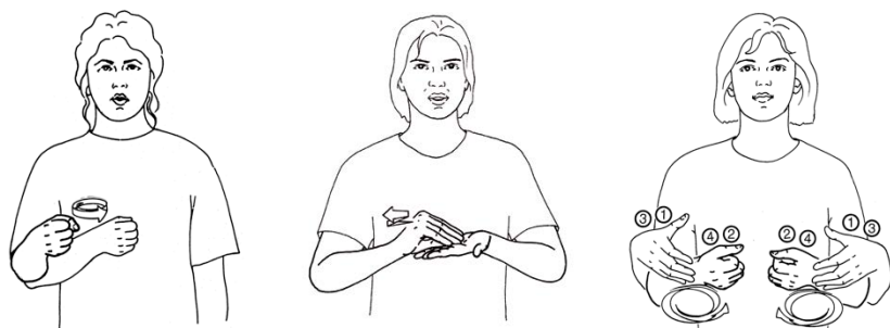
Figure 4: STIRRING, WRITING, and KNEADING.

It is very common in DGS that in addition to a sign’s core meaning (an action represented by the sign form as in STIRRING) it is also used in many other related senses – for example – for a profession typically associated with the activity, for a place or institution where the activity takes place, and for an object produced or manipulated by the activity.