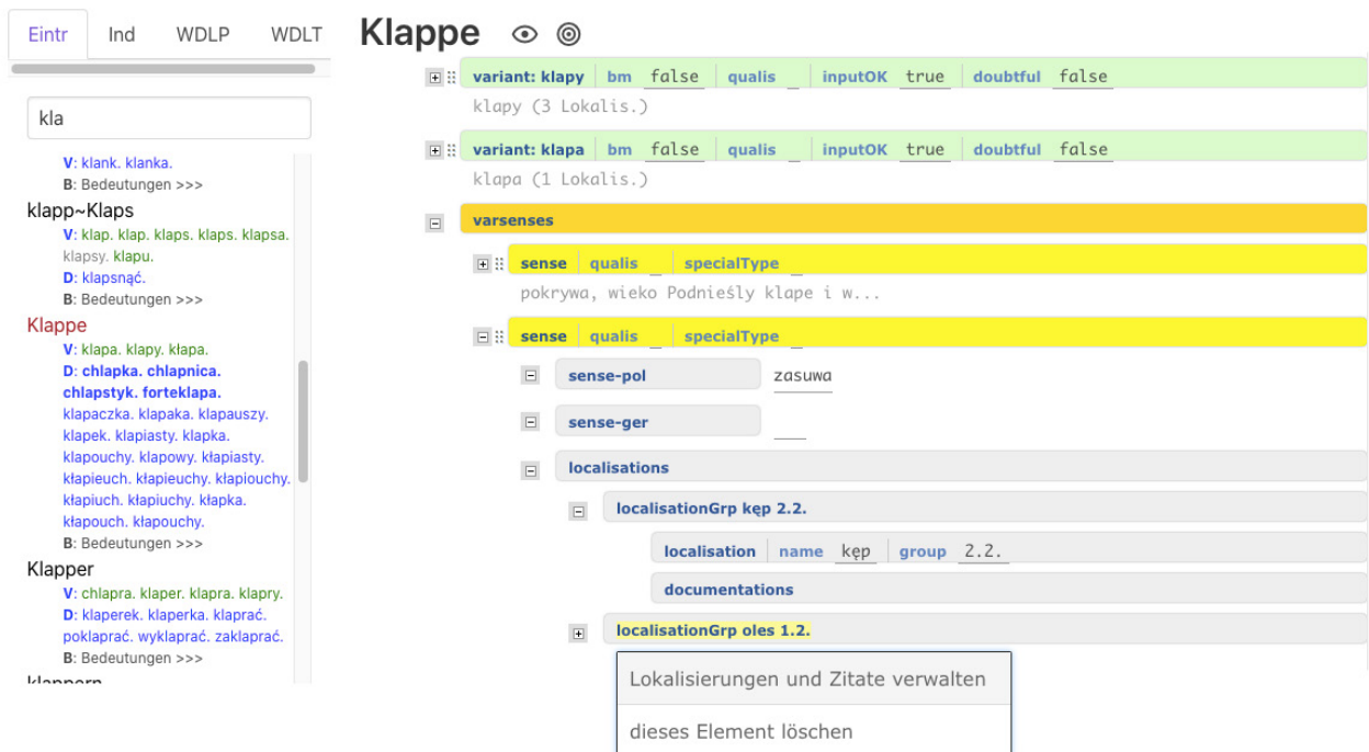
Figure 1: Basic XML editor screen.